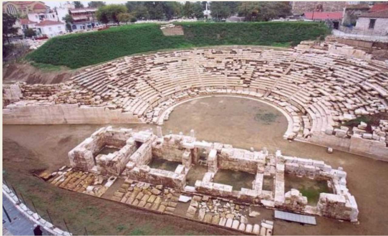
Theater in Larissa